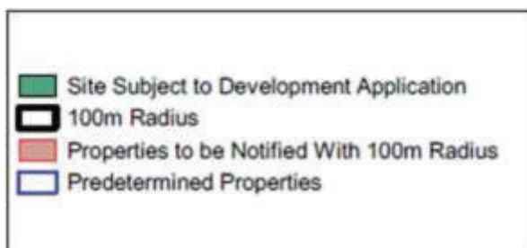
Figure 1 – Minimum notification area