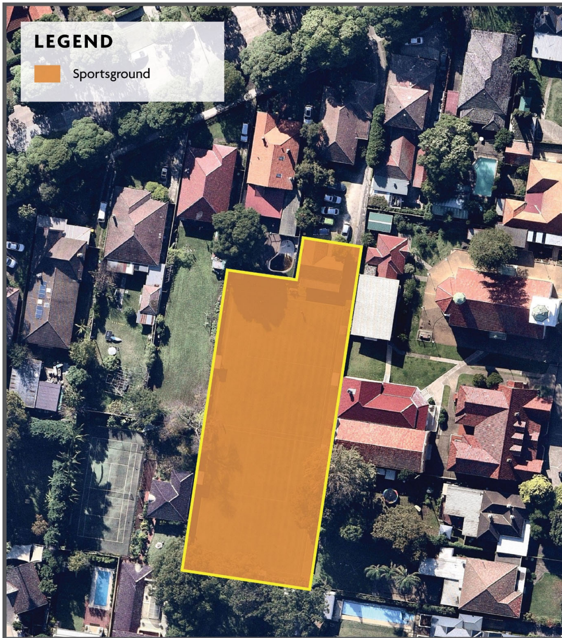
Figure 3 Map of 50 Redmyre Road Strathfield land categorisations