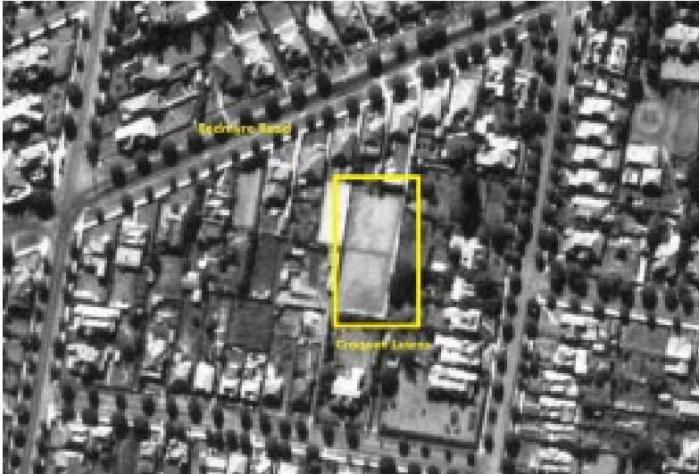
Strathfield Croquet Lawns aerial photograph (1947)