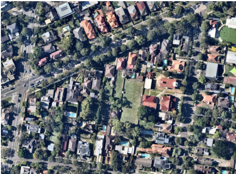
Strathfield Croquet Lawns aerial photograph (2019)