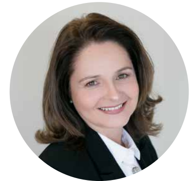
CR NELLA HALL