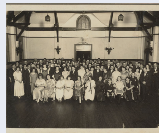
Image: Charity Ball, Strathfield Town Hall, 1924.

FOR MORE INFO ON LIBRARY PROGRAMS CALL 8762 0222 OR VISIT THE WEBSITE