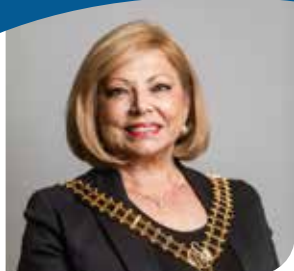
CR KAREN PENSABENE Mayor of Strathfield