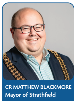
CR MATTHEW BLACKMORE Mayor of Strathfield