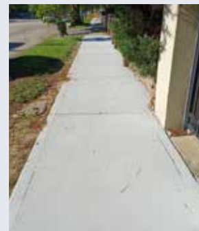
Images: left to right - Cutbush Ave, High Street, Ford Street and Homebush Street.