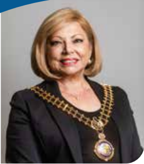
CR KAREN PENSABENE Mayor of Strathfield