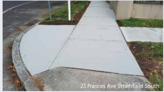
23 Frances Ave Strathfield South

The aim is to have the entire SRV footpath program completed prior to 30 June 2024 (weather permitting).