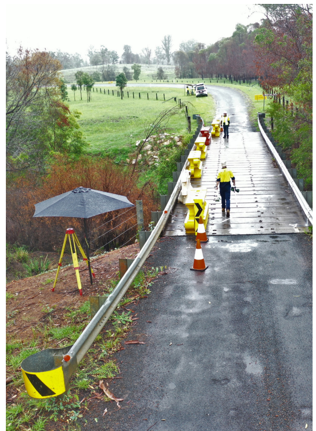
Our staff assessing a bridge damaged by bushfire.

The recent bush fires have devastated these communities. Council is determined to provide every assistance possible to enable a swift recovery.